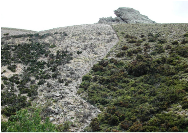
Fig. 3 Grazing land belonging to two farmers and subjected to grazing intensity

management practices and techniques for combating desertification. The proposed methodology provides a series of effective indicators that would help people to identify where land desertification is a current or potential problem, and which could be the actions to alleviate the problem over time. For the application the following steps must be followed: (a) choose the appropriate land use (agriculture, pasture, forest) (Table 4), (b) decide for the land degradation process or cause (water erosion, tillage erosion, soil salinization, etc.) for selecting the appropriate equation (Table 5), (c) define the data and the appropriate indices of the corresponding indicators (Table 2) and introduce to the equation, and (d) calculate the DRI. The derived methodology can be easily used through the expert system loaded in the DESIRE website available at: http://www.desire-his.eu/en/assessment-with-indicators/wp22-evaluation-a-short-list-of-indicators-thematicmenu-174/66-study-site-indicators . After defining desertification risk, the land user has the ability to change values of indicators related to land use and land management practice for establishing promising conservation strategies for reducing desertification risk at field or regional level. As described by Karavitis and others (this issue) a computer application has been developed that allows users to calculate desertification risk based on the equations that have been developed.