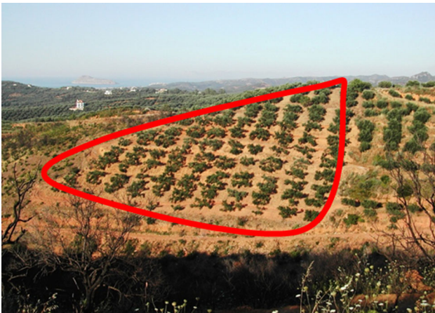
Fig. 2 Example of study field site (sampling point) with defined soil, topography, land use, and land management characteristics belonging to a certain farmer

number of candidate indicators used for the analysis in each process or cause ranged from 16 to 50. A forward stepwise multiple regression analysis was applied using desertification risk as the dependent variable and the candidate indicators assigned for each process as independent variables, using the following linear model (Steel and others 1997):