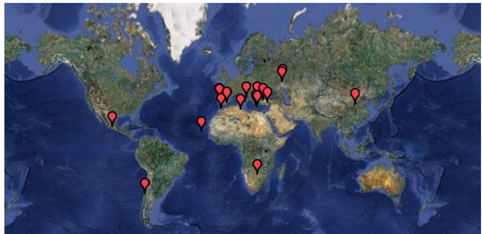
Fig. 1 Distribution of the investigated study sites

thematicmenu-173/160-manual-for-describing-land-degradation-indicators ).